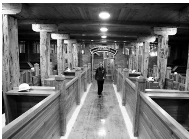
Мал. 2. Соляна шахта міста Величка, Польща