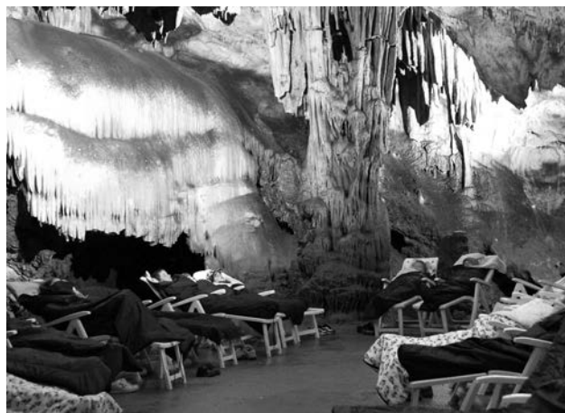
Мал. 1. Карстова печера Ясовська, курорт Штос, Словаччина

Considering the nearly five decades of experience of speleotherapy in Solotvyno and the achievements of our colleagues from Poland, the principles of a differentiated